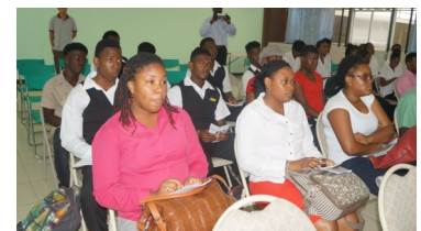
Prospective Taiwan scholarship candidates listening attentively