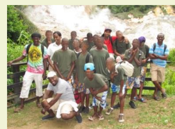
Sulphur Springs Field Trip