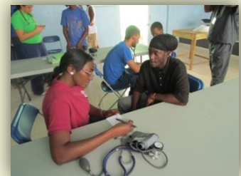
BTC Health Clinic

As each ward's abilities are identified he is given extra support with these specific abilities and the centre is now looking to the wider community to develop apprenticeship programmes in the areas of auto mechanics, welding, agriculture and woodwork.