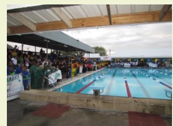
14th Annual RHAC Invitational Swim Meet