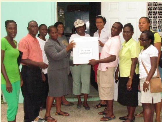
DONATION FROM THE EYE TO EYE COUPLES GROUP OF THE GROS ISLET SDA CHURCH