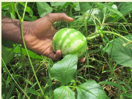
Vocational Skills Program in action