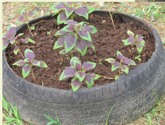
WORLD ENVIRONMENTAL DAY PROJECT