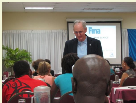
BTC wards at FINA Level 2 Coaching Course at Bay Gardens Hotel