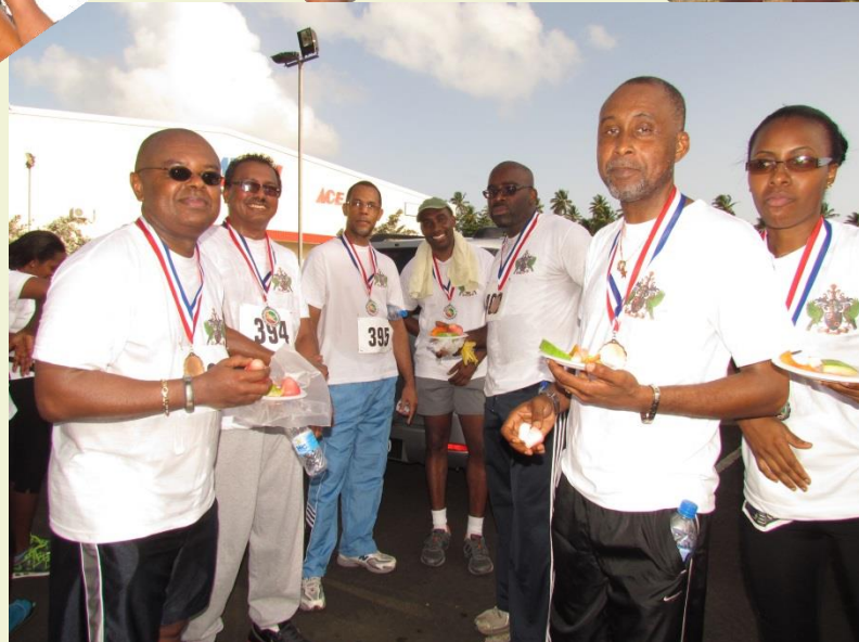
PUBLIC SERVICE WALK 2013