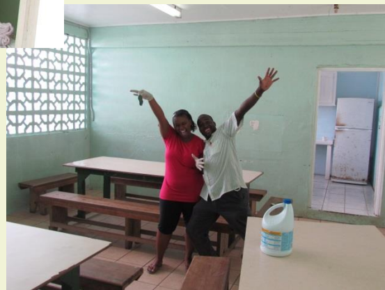
BTC Clean Up Fridays