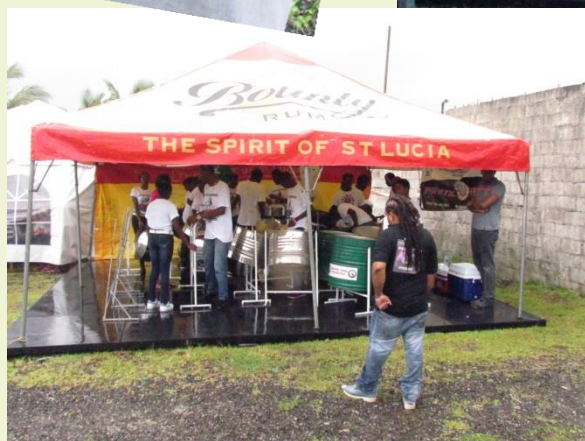
BTC wards playing at opening of carnival, Samans Park