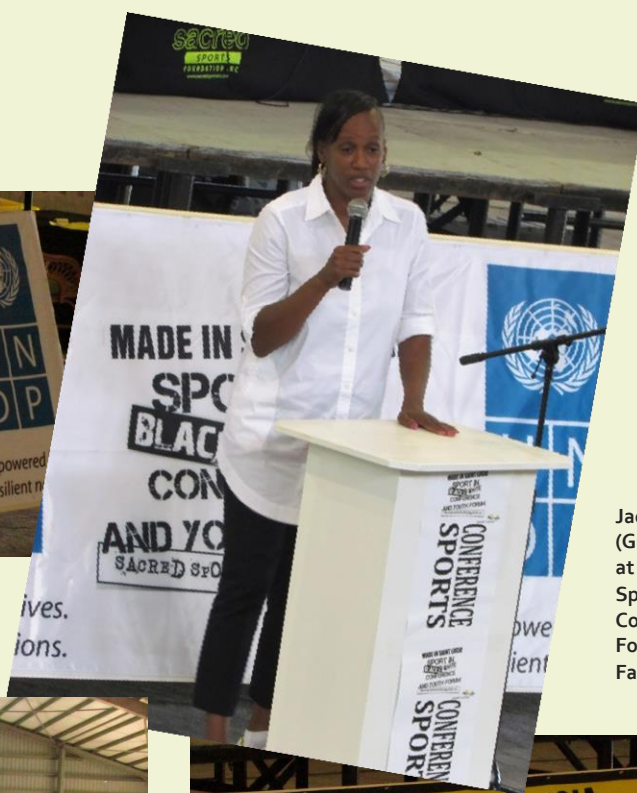
Jackie Joyner Kersee, (Guest Speaker) speaking at the Made in Saint Lucia Sport in Black & White Conference and Youth Forum, Beausejour Indoor Facility