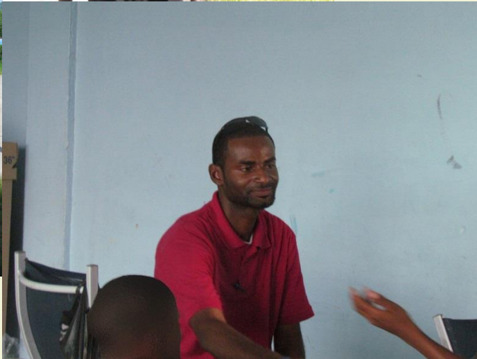
SURE FOUNDATION FOOTBALL SATURDAYS & MOVIE NIGHT